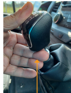
Pinch for reverse